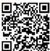
Scan QR Code

Electronic Giving Signing up is easy with Faith Direct! Scan our QR Code or visit faith.direct/CO846 or text 'Enroll' to 720-713-3363. Or to give a one-time donation for our weekly offertory text "$ with the dollar amount" 720-713-3363.